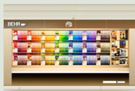
2009: Behr Paint