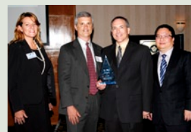
2010: The Boeing Co.